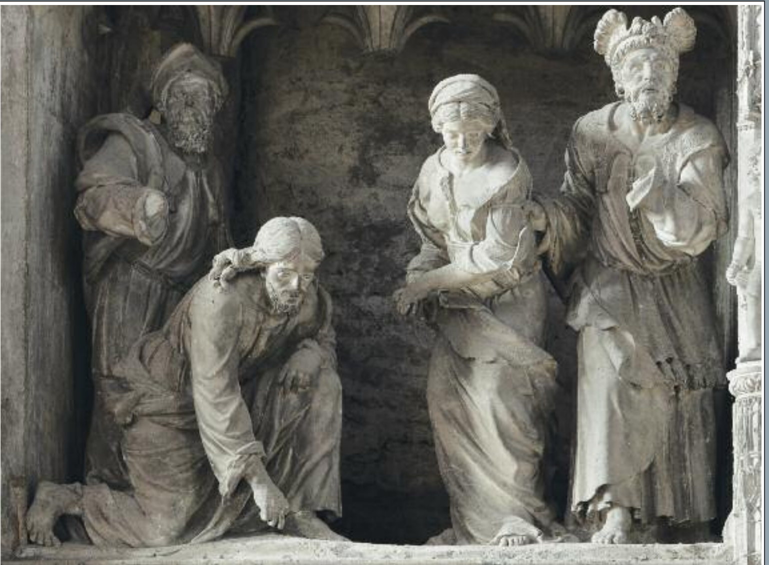
Christ and the Woman Taken in Adultery.